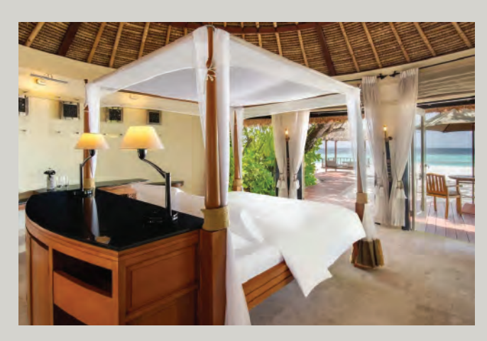
Beachfront Pool Villa (110sqm)