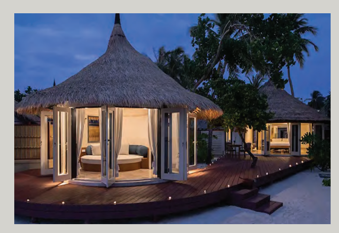
Grand Beachfront Pool Villa (132sqm)