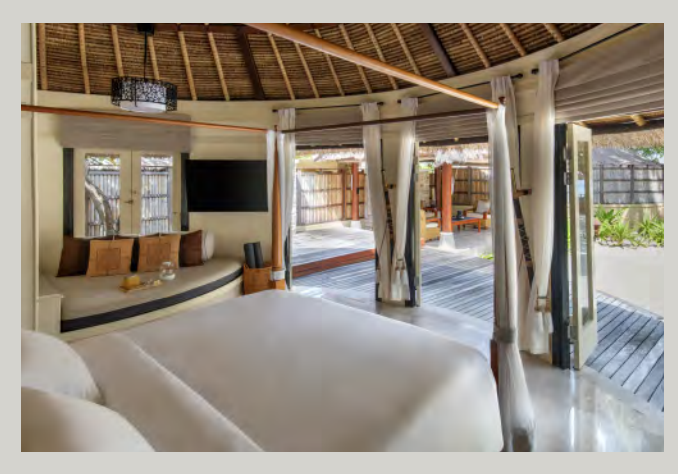
Wellbeing Sanctuary Pool Villa (120sqm)