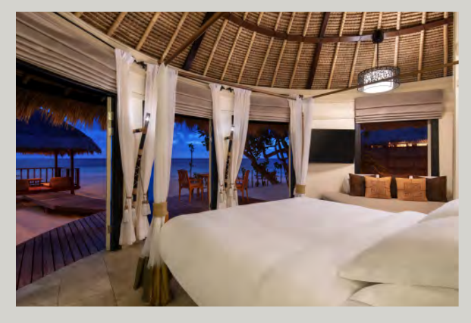
Beachfront Sunset View Pool Villa (110sqm)