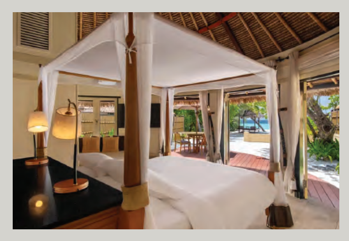
Oceanview Pool Villa (110sqm)